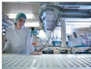
Consumer packaged goods machinery