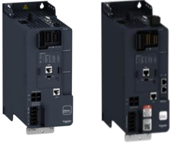
Modular W/o E With Ethernet