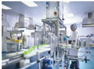
Packing and packaging machines

Winder & Rewinder, Waiving, Texturizer, cutter, Extrusion, slitter