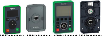
VW3A1113 VW3A1114 VW3A1111 VW3A1112